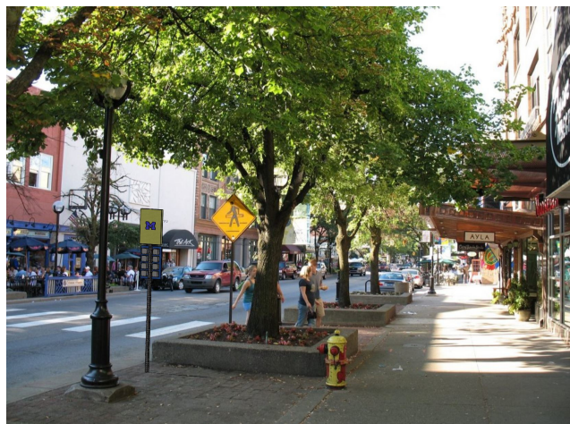
Figure 1: Signpost in an urban setting. Sign posts are natural and unobtrusive sights in even modestly urban settings. The form factor is conducive to reasonably large solar panels and provides area for mounting a diverse array of sensor modules, all while blending into the background environment of a city.

City-scale sensing, Modular architecture, Energy harvesting